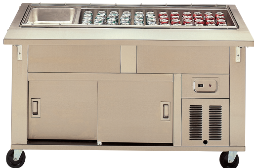
4-CB shown with optional cutting board

The innovative "Cool Breeze" technology allows you to maintain product at 41 degrees Fahrenheit or less yet requires no ice. The unit cascades a "Cool Breeze" of air over the product without drying it out or causing freezer burn.